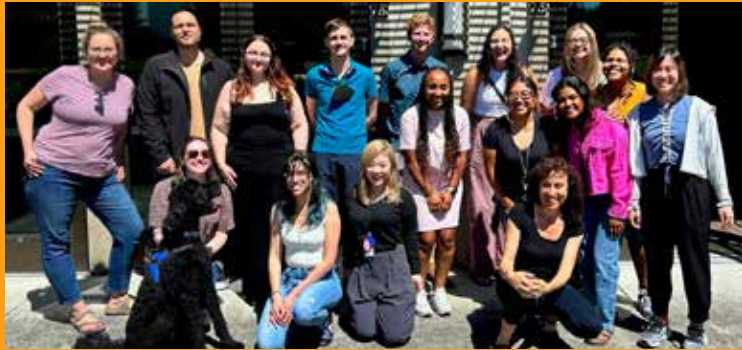
A group of YES staff from the annual YES BBQ

In addition to YES' financial recovery needs you have likely already read or heard about, in 2022 we also focused on supporting the resiliency and recovery of staff. Over the past few years our clinicians and outreach staff ceaselessly focused on helping clients presenting with significant life stressors, a greater volume of disruptive household and classroom behaviors, and intense behavioral health challenges like severe depression, anxiety, and substance use issues, at a time when they too may have had increased stress and struggles.