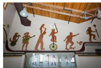
YES Parade (left)